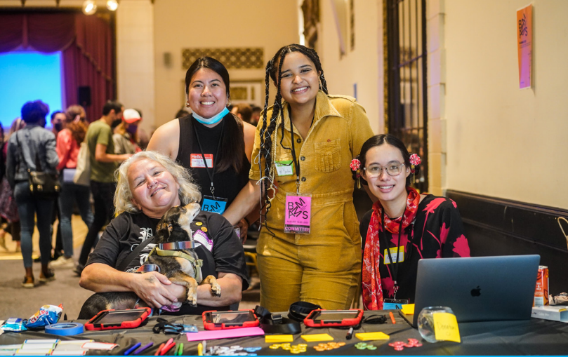
Registration Table / BAMMS Volunteers